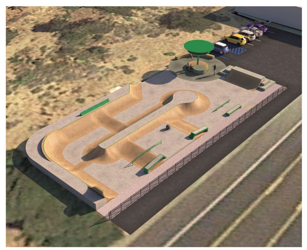
Figure 2 - Proposed conceptual design looking toward the southeast