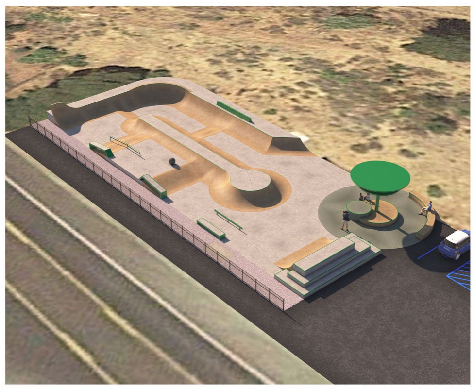
Figure \ 3-Proposed\ conceptual\ design\ looking\ toward\ the\ northwest