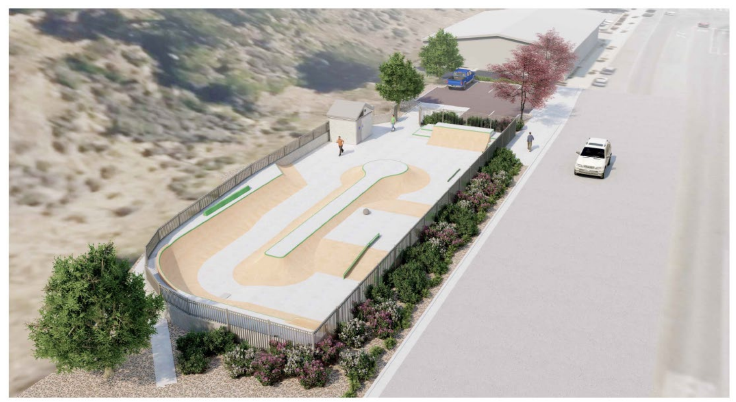
Figure 4 - Proposed conceptual design shown with improvements (improvements are outside the scope of this RFP)

The RFP, as well as any responses to questions/clarifications/requests for additional information, can be viewed, and any questions and requests for further information and/or clarification of the RFP can be submitted on the District's website at <a href="https://www.cambriacsd.org/request-for-qualifications-and-proposals.">https://www.cambriacsd.org/request-for-qualifications-and-proposals.</a>