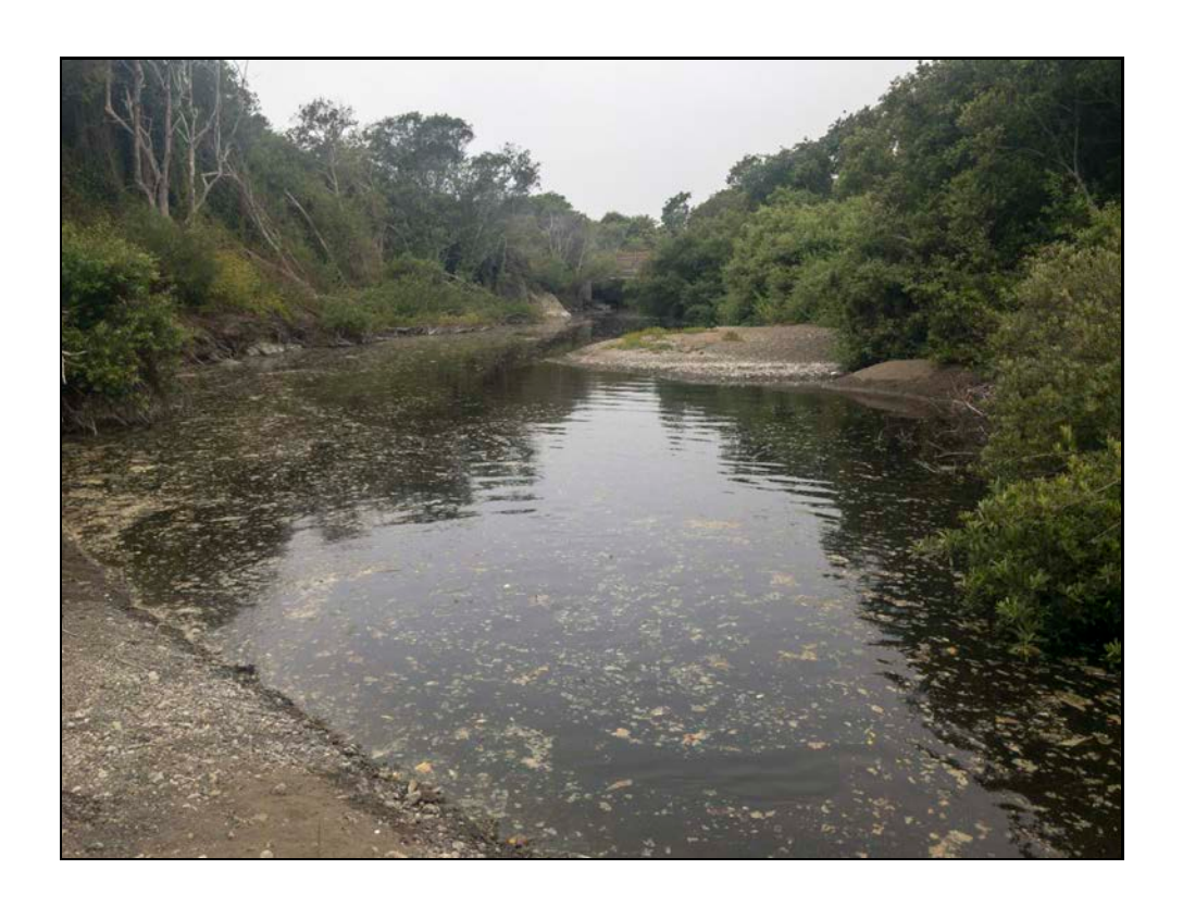
Downstream, Van Gordon Cr