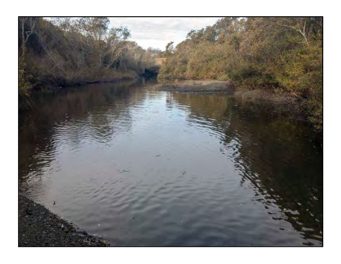
Downstream, Van Gordon Cr