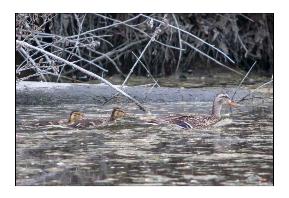
Birds, Mallard, Van Gordon Cr