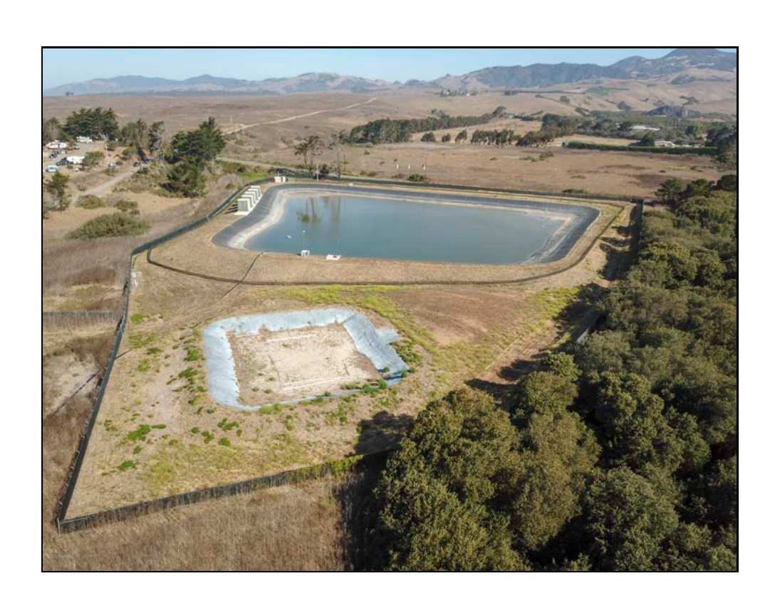
Aerial, Evaporation Pond