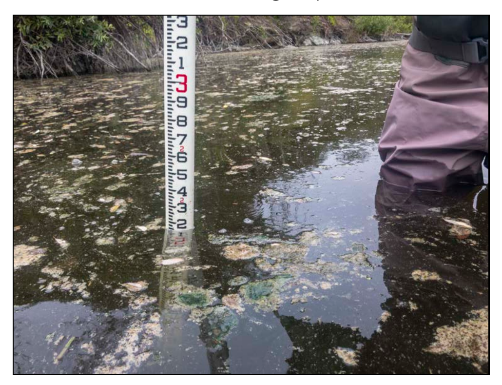
Van Gordon Cr, Water Depth