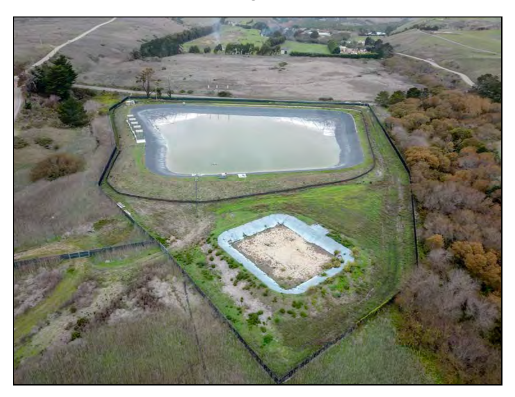
Aerial, Evaporation Pond