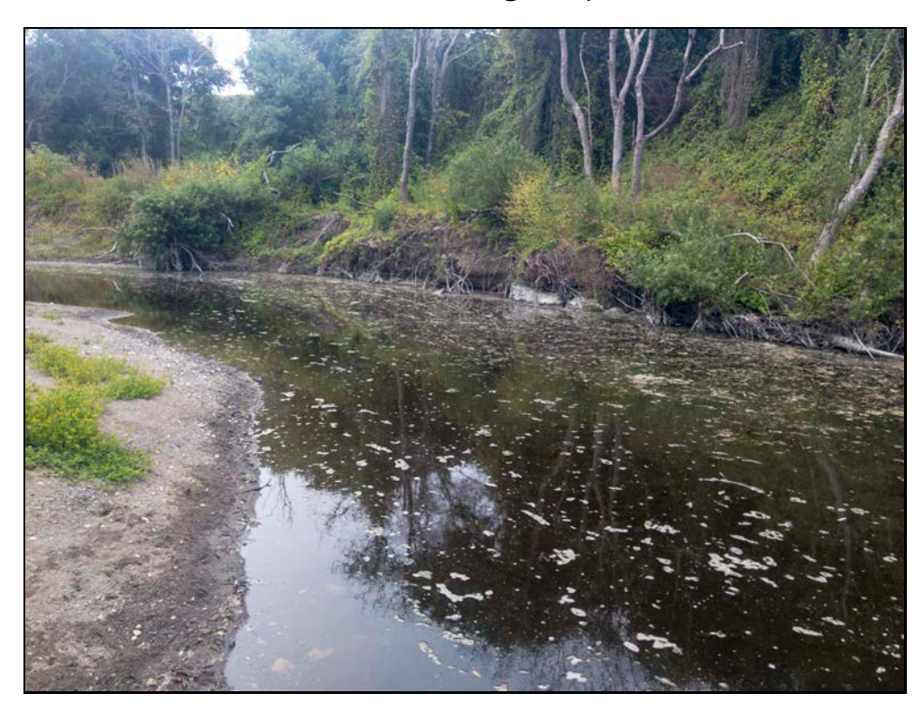
Upstream, Van Gordon Cr