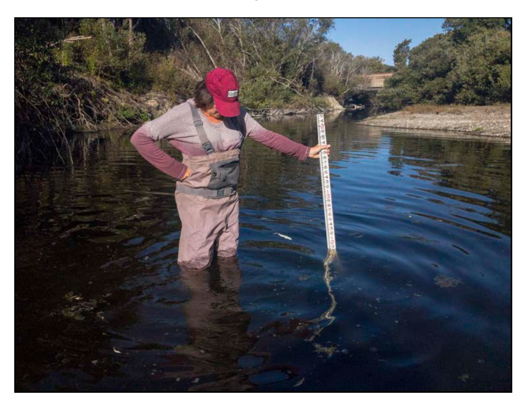
Van Gordon Cr, Water Depth