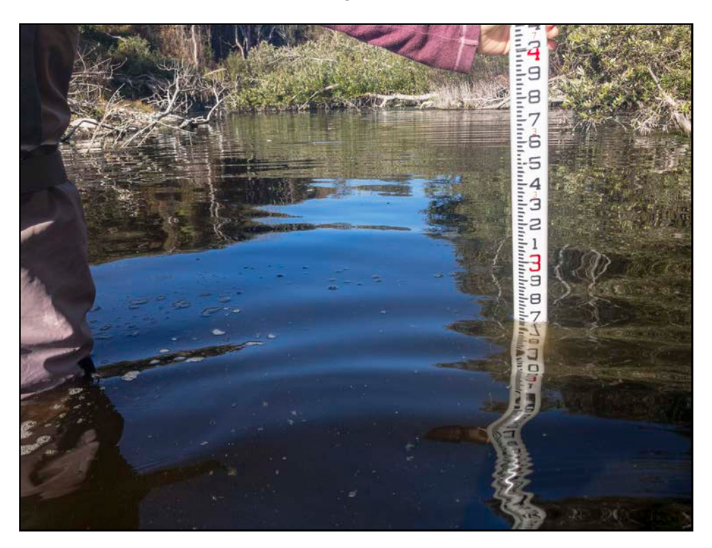
Red Legged Pool, Water Depth