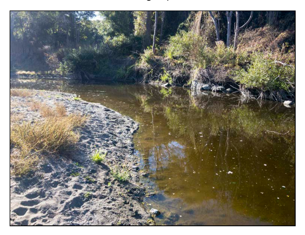
Upstream, Van Gordon Cr