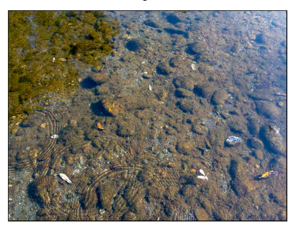
Red Legged Pool, Substrate