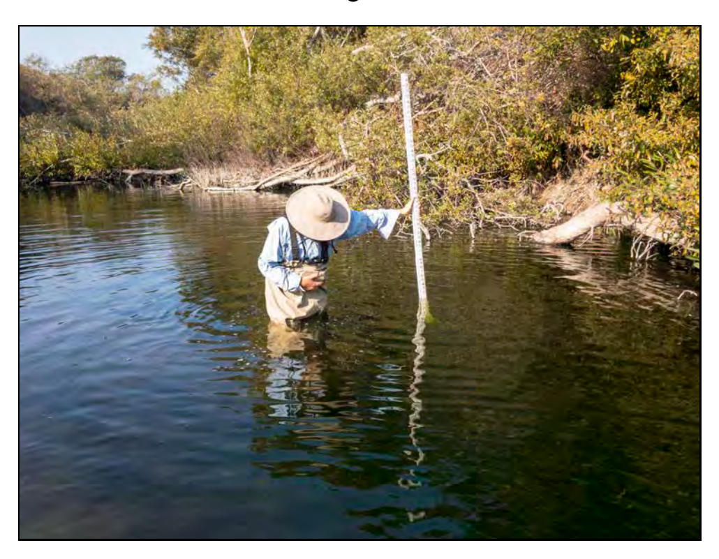
Red Legged Pool, Water Depth