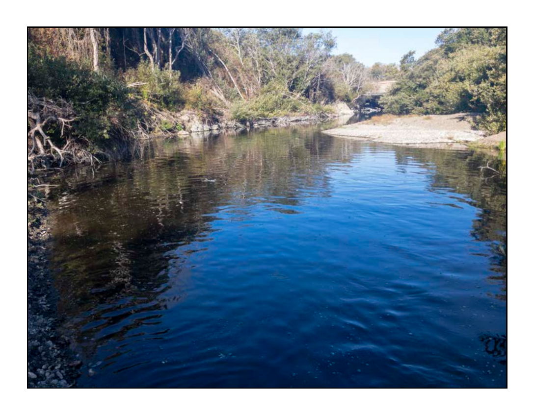
Downstream, Van Gordon Cr