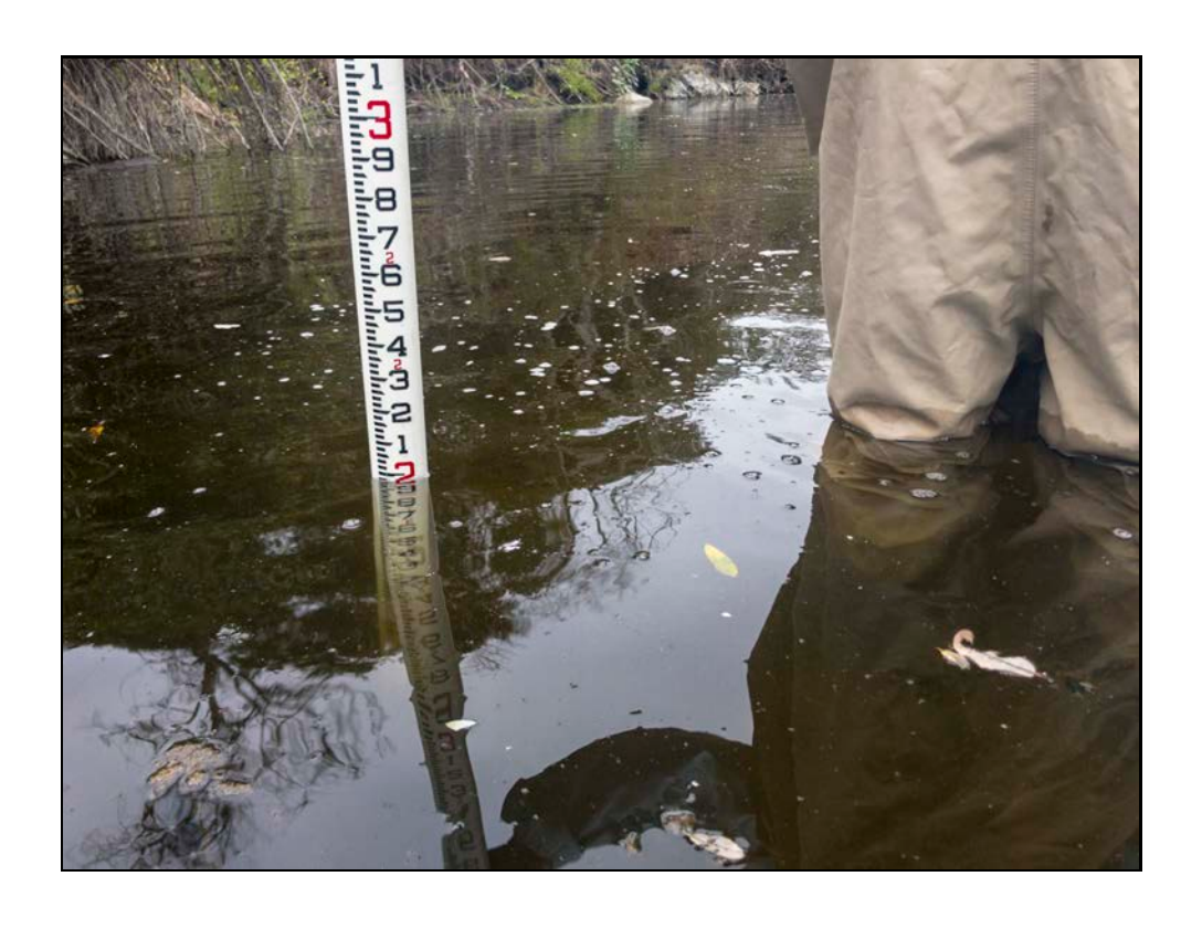
Van Gordon Cr, Water Depth