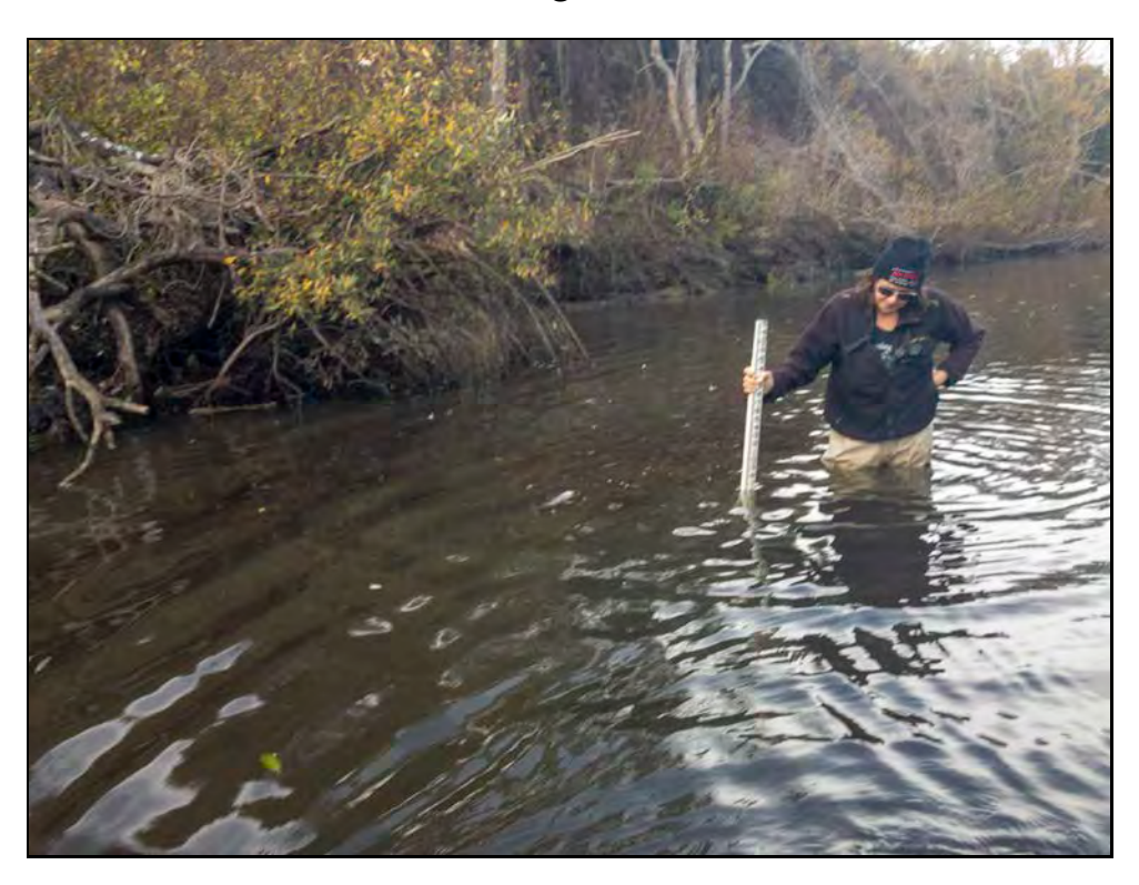
Van Gordon Cr, Water Depth