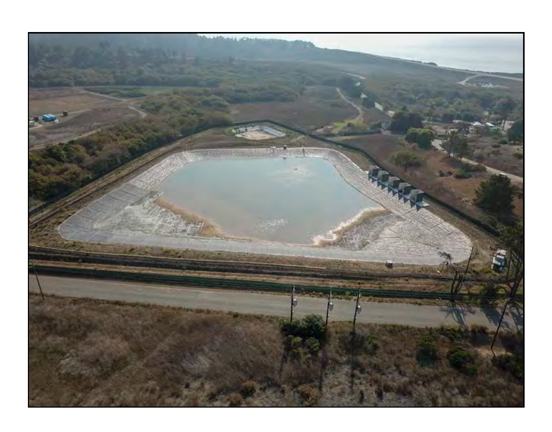
Aerial, Evaporation Pond