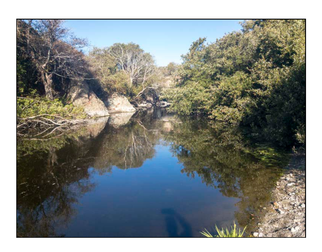
Downstream, Walking Bridge