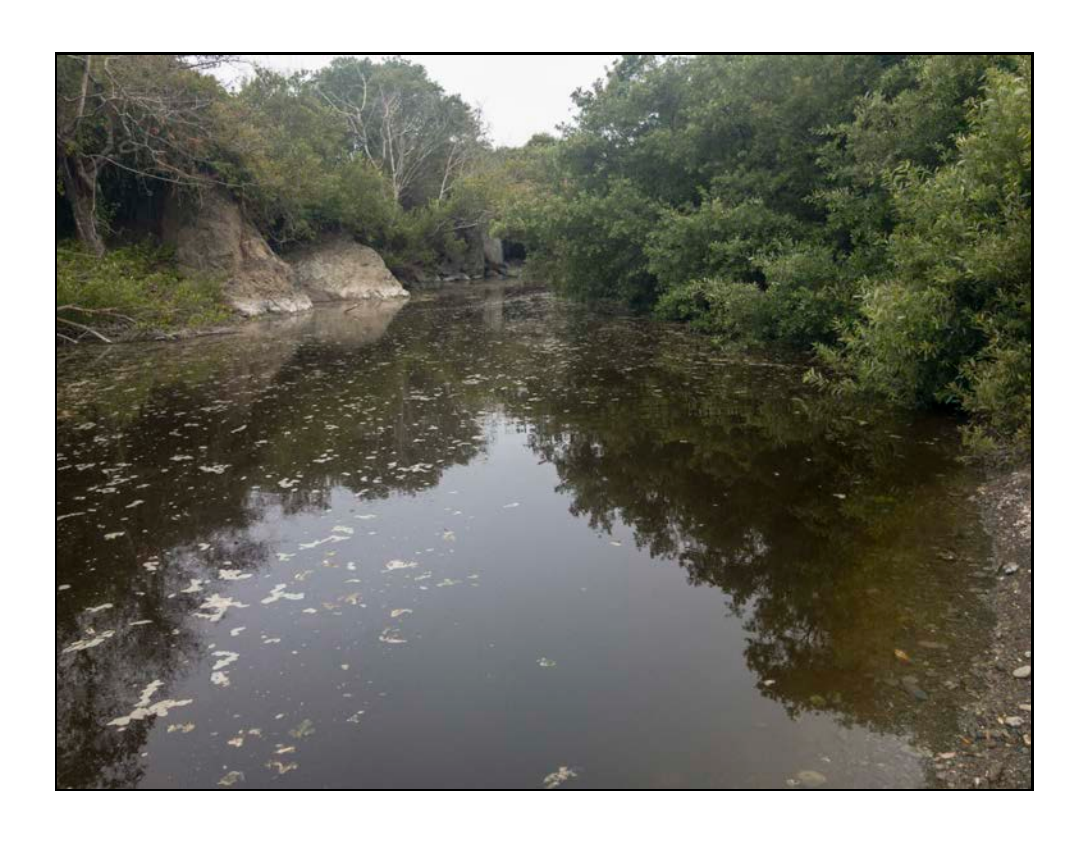
Downstream, Walking Bridge