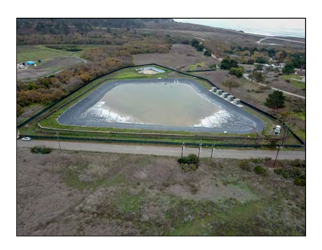
Aerial, Evaporation Pond