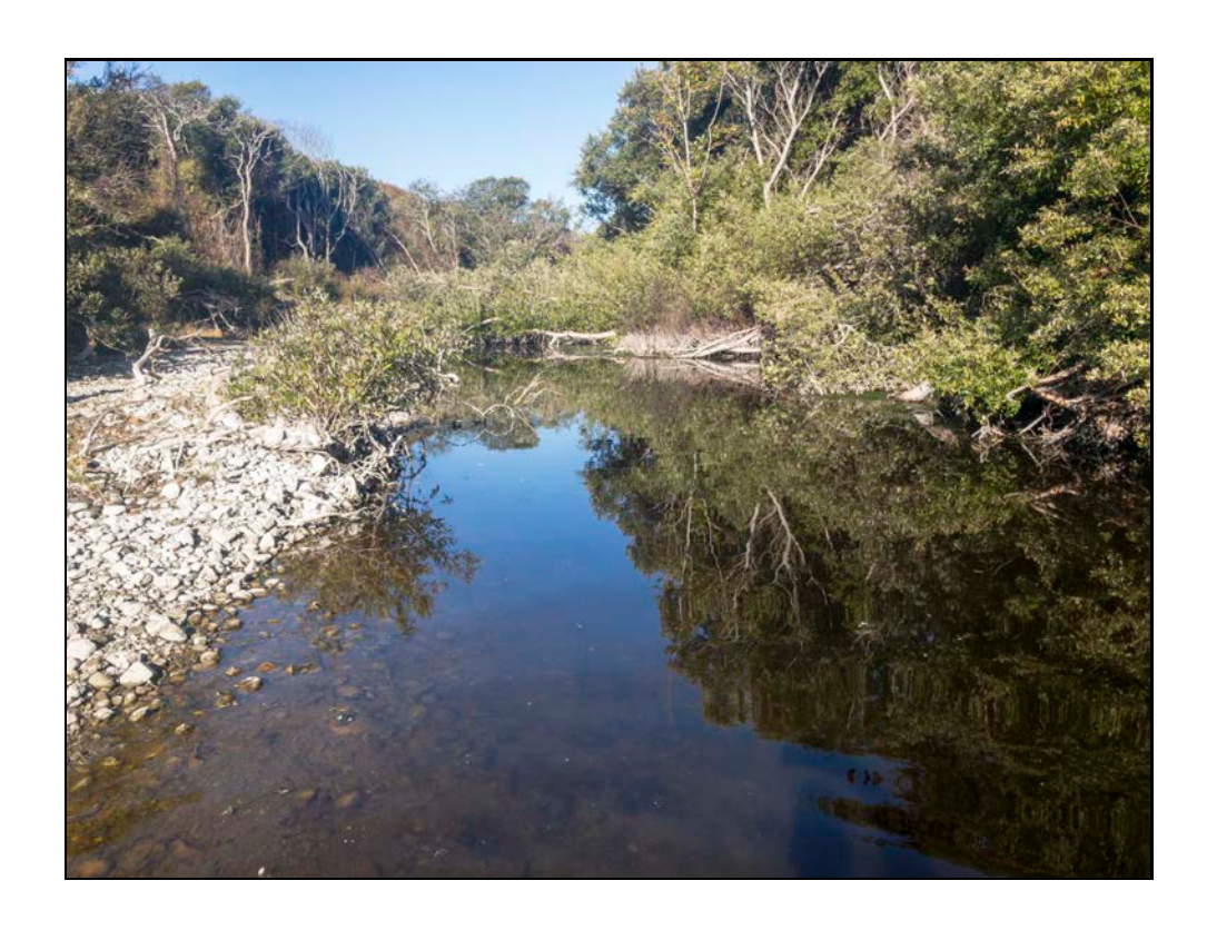
Downstream, Red Legged Pool