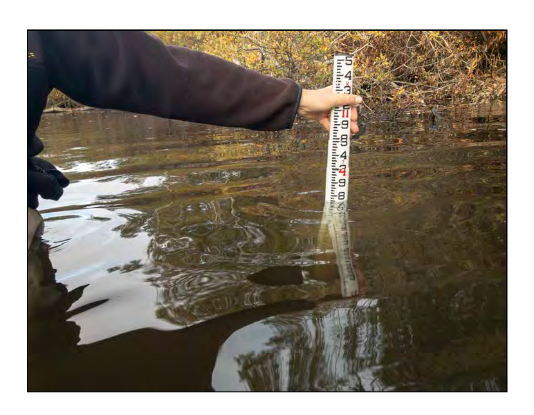
Red Legged Pool, Water Depth