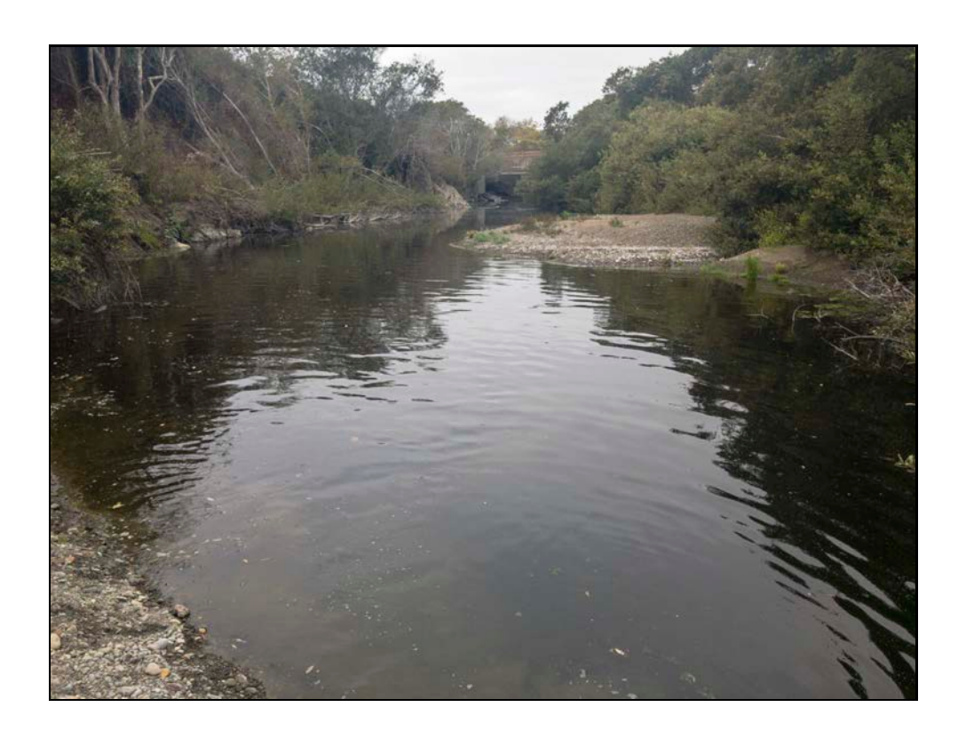
Downstream, Van Gordon Cr