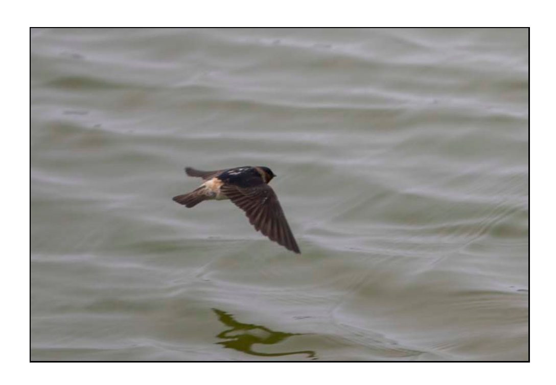
Birds, Cliff swallow, Evaporation Pond