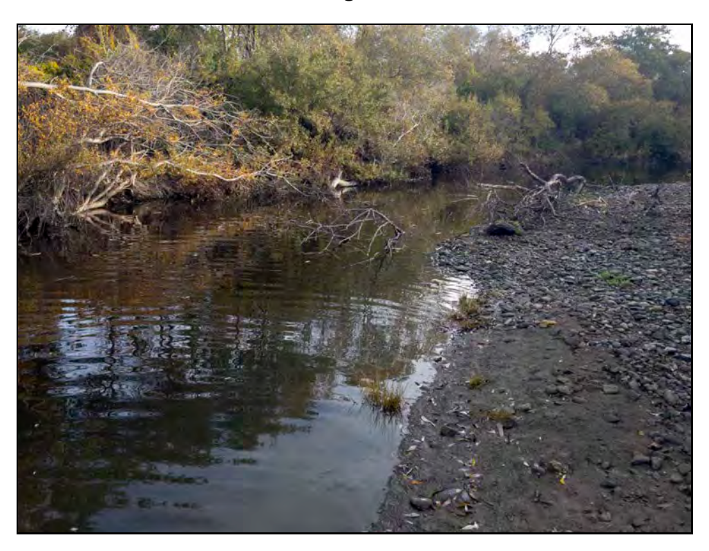
Red Legged Pool, Upstream