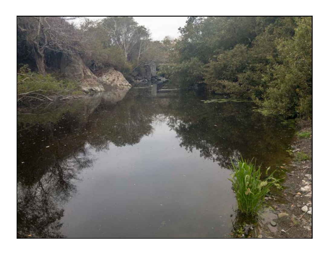
Downstream, Walking Bridge