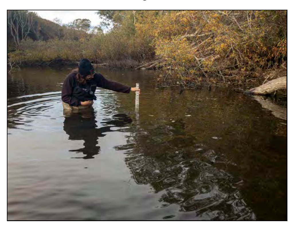
Red Legged Pool, Water Depth