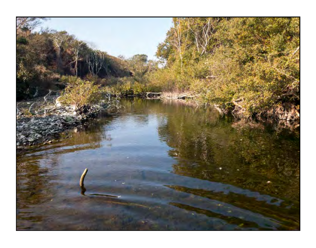
Downstream, Red Legged Pool