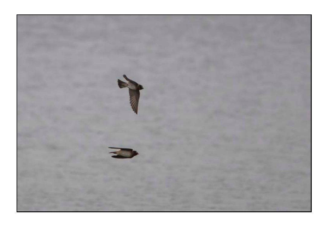
Birds, Cliff swallow, Evaporation Pond