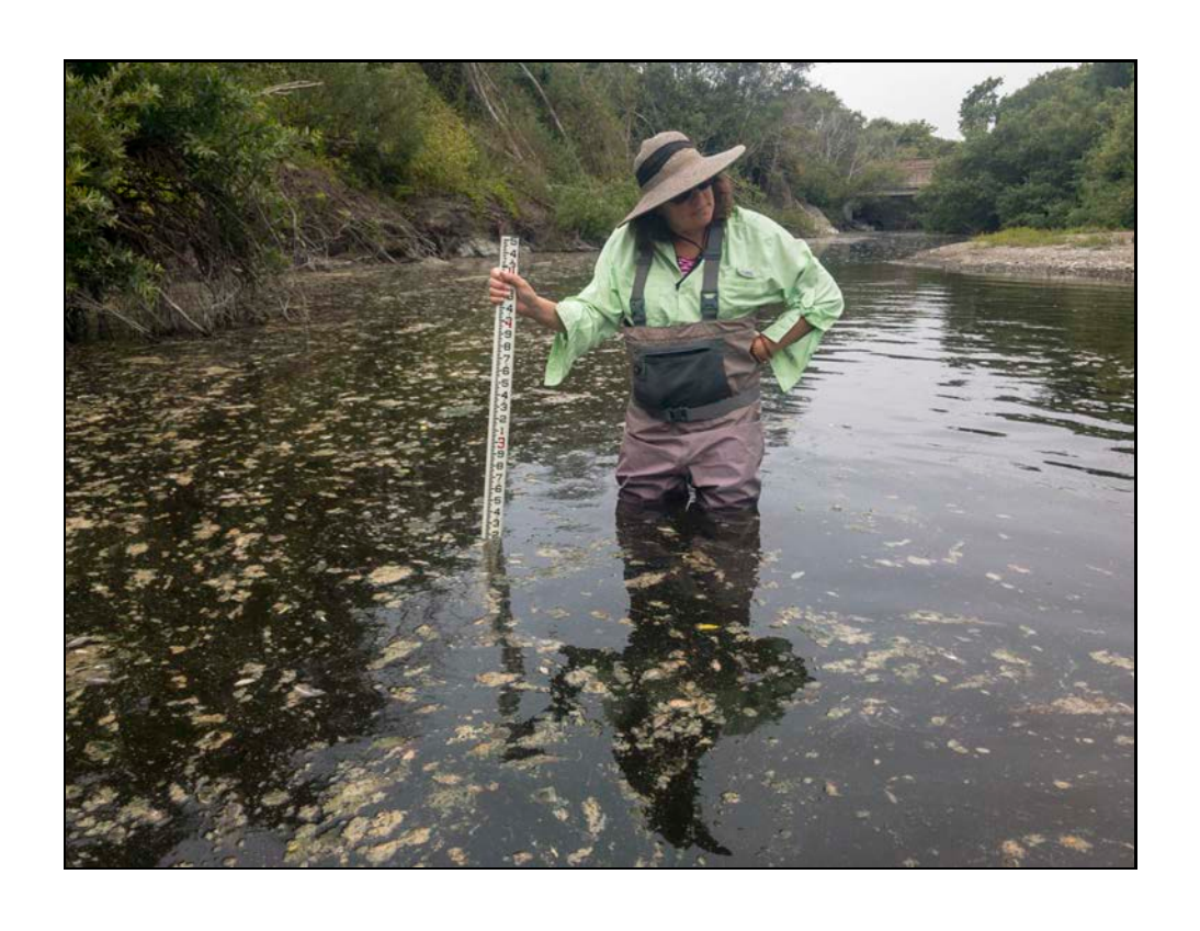
Van Gordon Cr, Water Depth