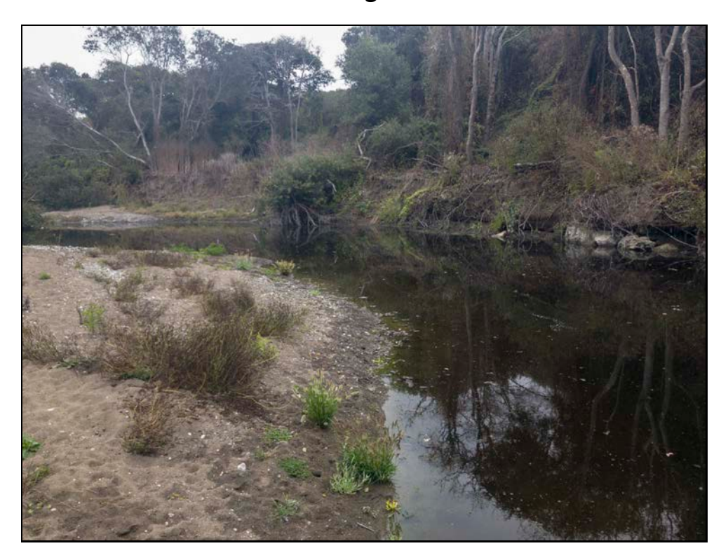
Upstream, Van Gordon Cr