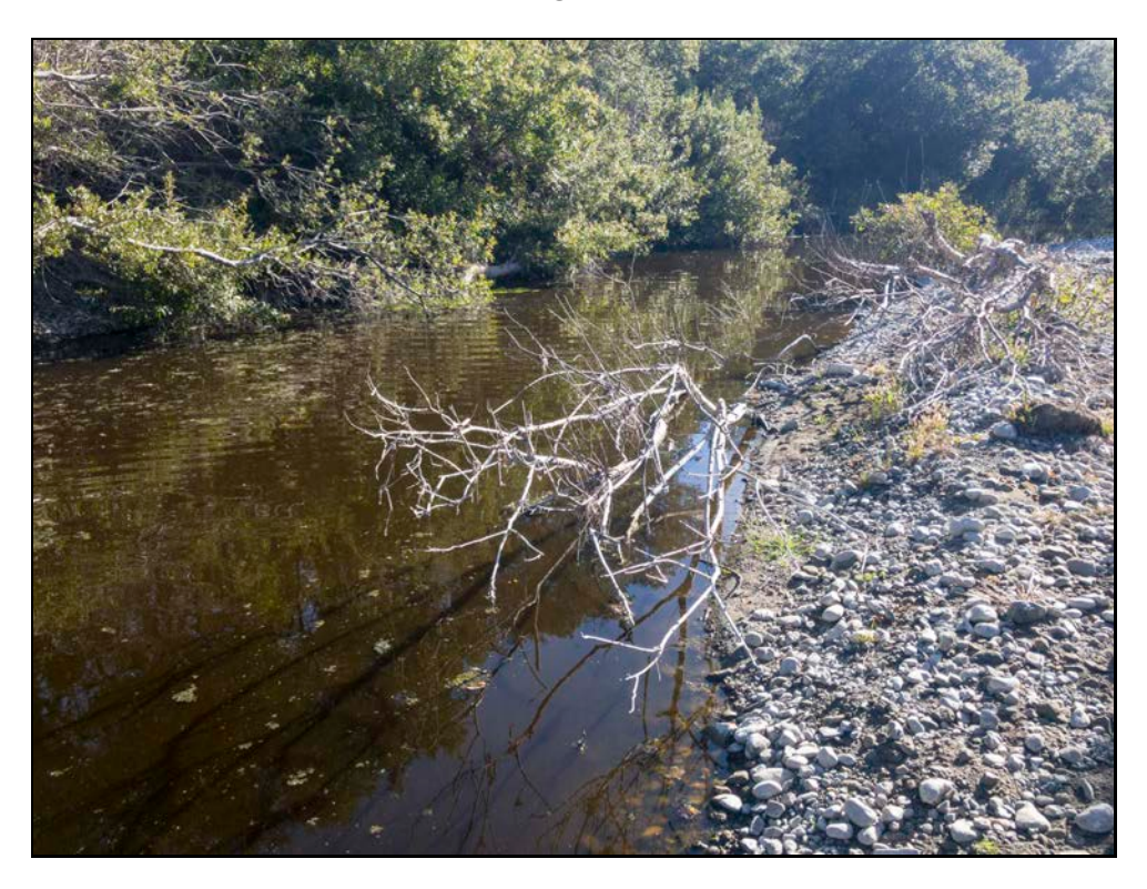
Red Legged Pool, Upstream