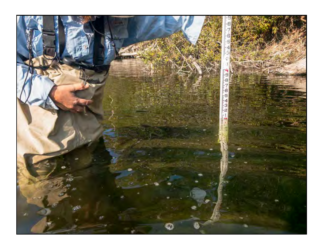
Red Legged Pool, Water Depth