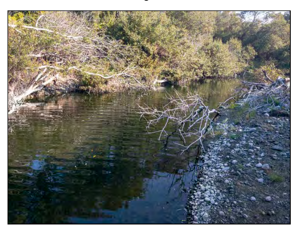
Red Legged Pool, Upstream