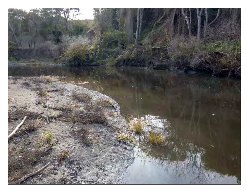
Upstream, Van Gordon Cr