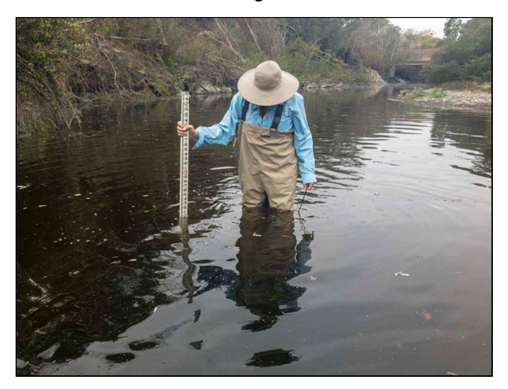
Van Gordon Cr, Water Depth