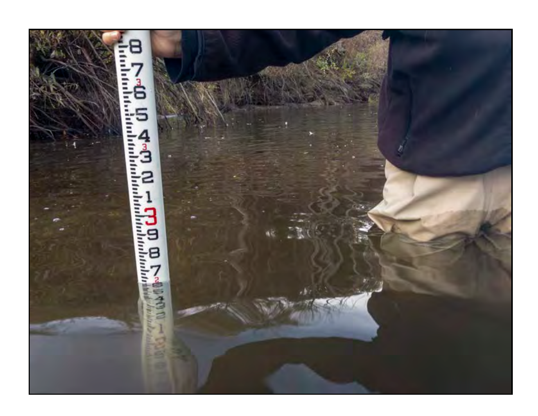
Van Gordon Cr, Water Depth