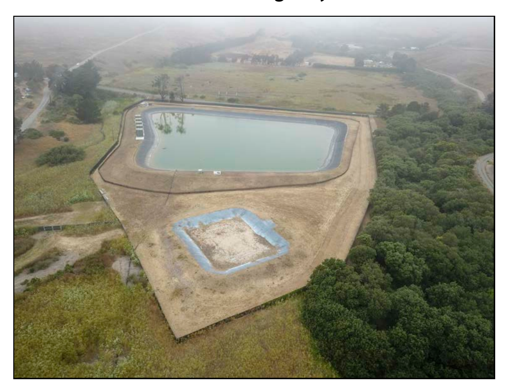
Aerial, Evaporation PondDCIM\100MEDIA\DJI_0140.JPG