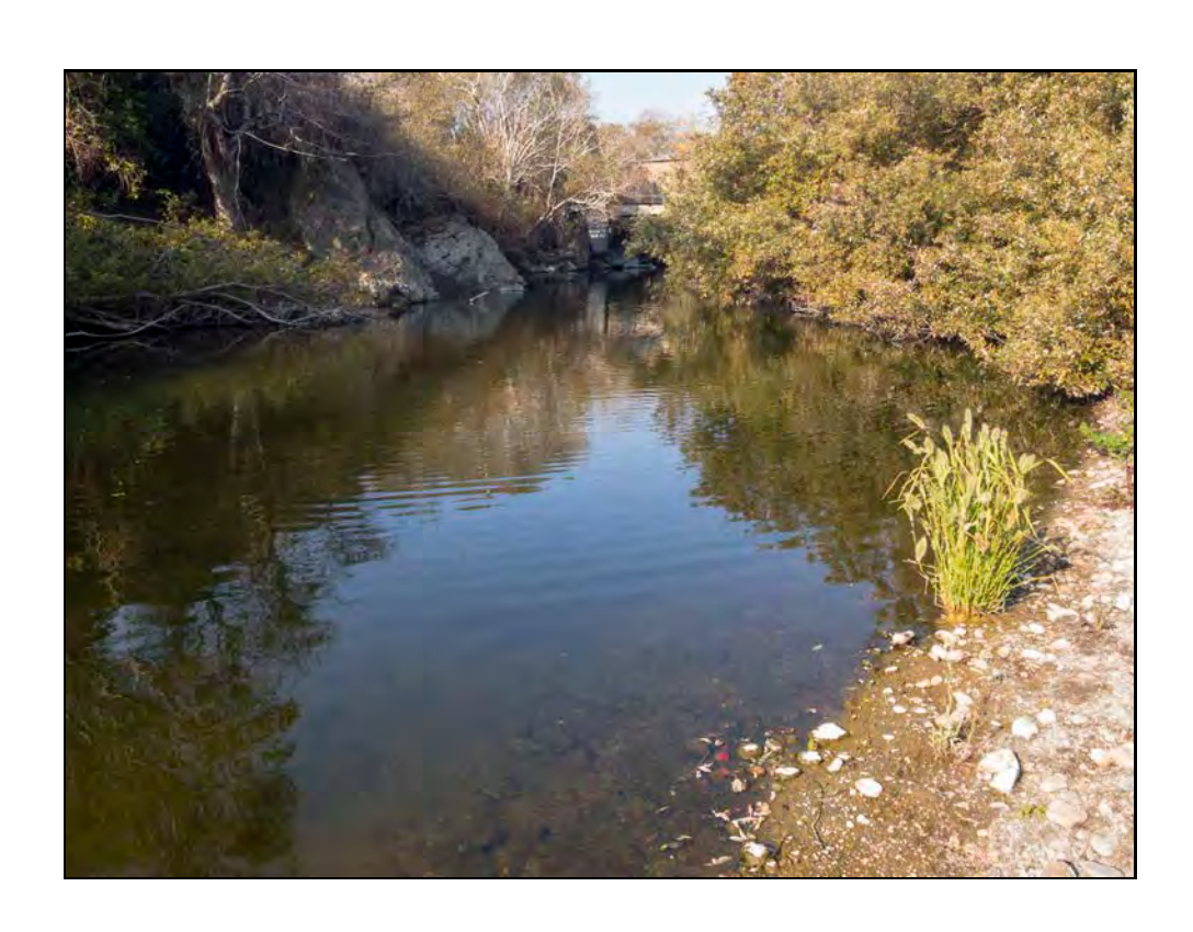
Downstream, Walking Bridge