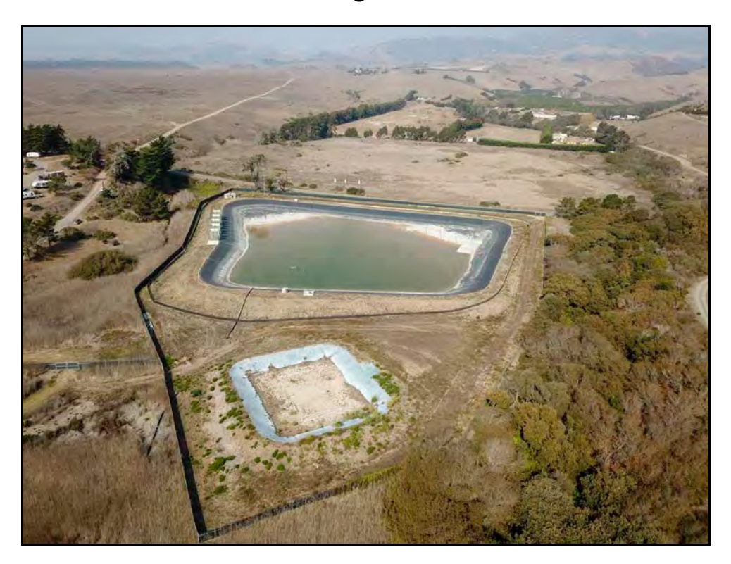
Aerial, Evaporation Pond