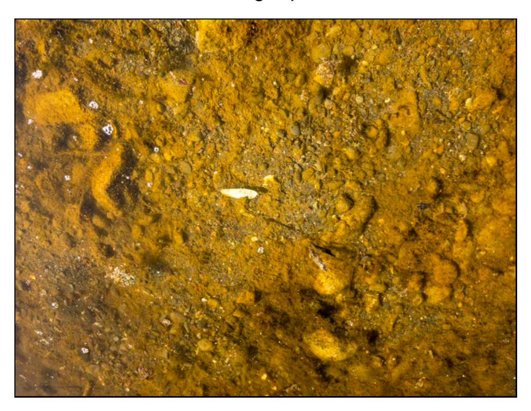
Red Legged Pool, Substrate