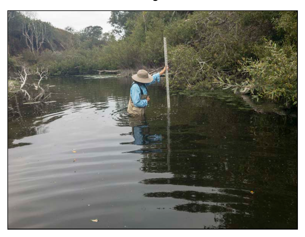
Red Legged Pool, Water Depth