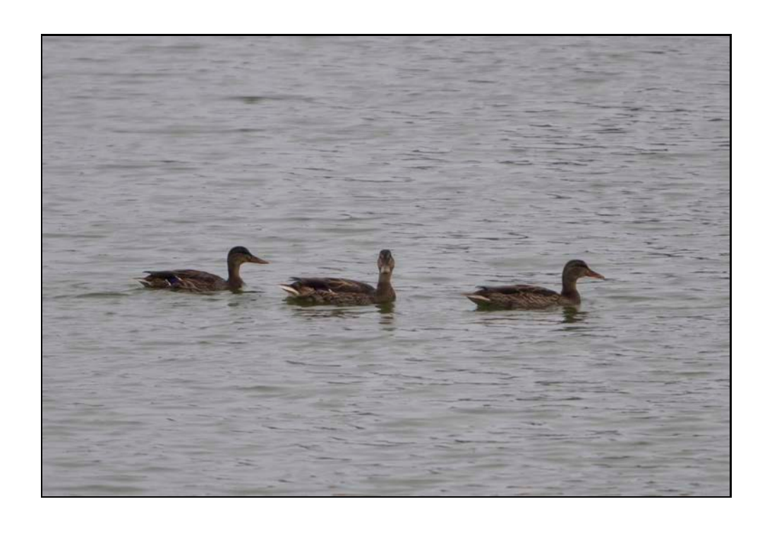
Birds, Evaporation Pond, Mallard