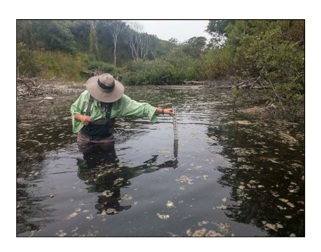
Red Legged Pool, Water Depth