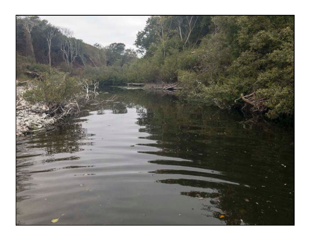
Downstream, Red Legged Pool