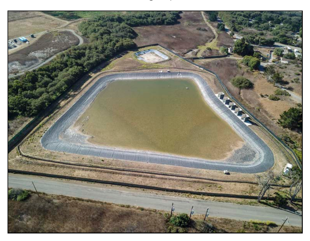
Aerial, Evaporation Pond