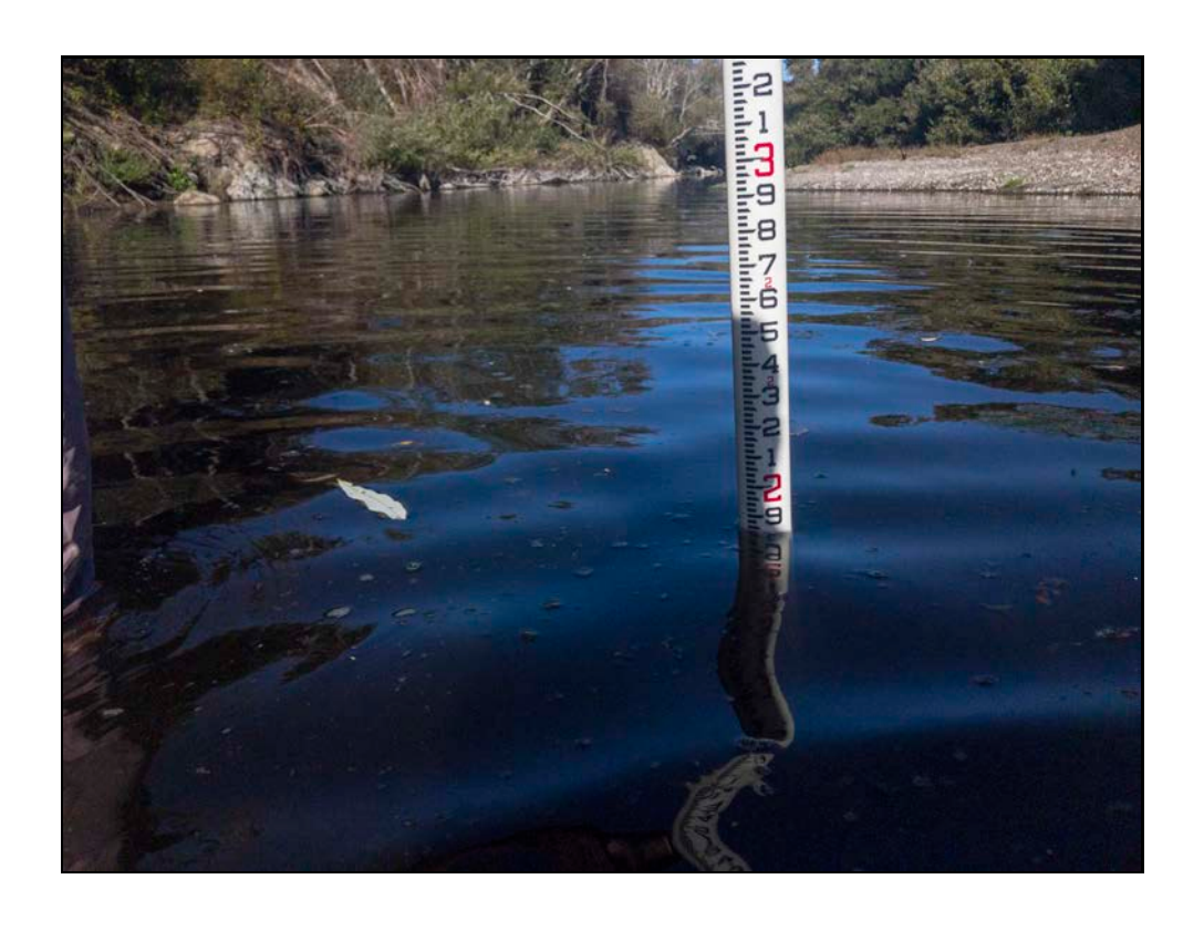
Van Gordon Cr, Water Depth