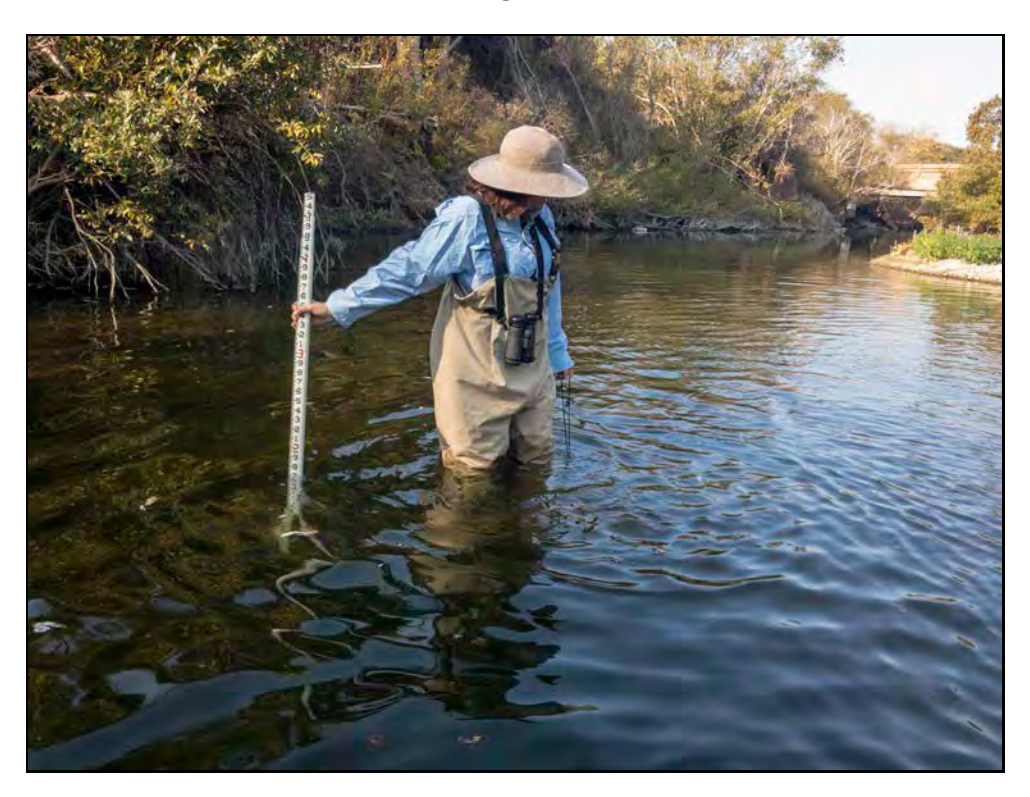
Van Gordon Cr, Water Depth