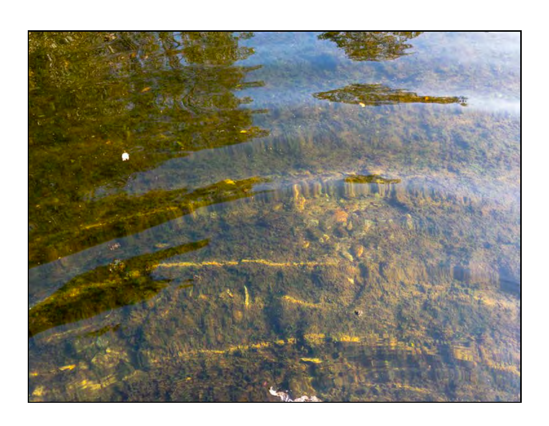
Red Legged Pool, Substrate