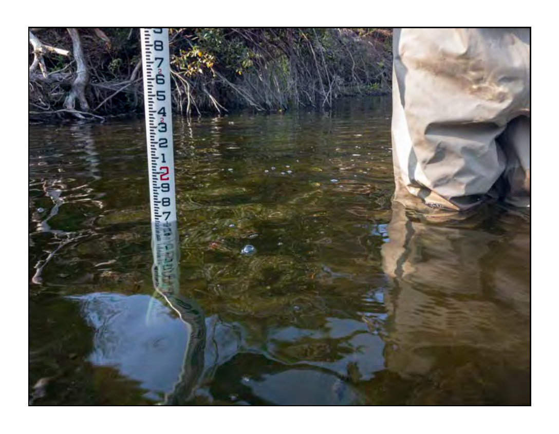
Van Gordon Cr, Water Depth