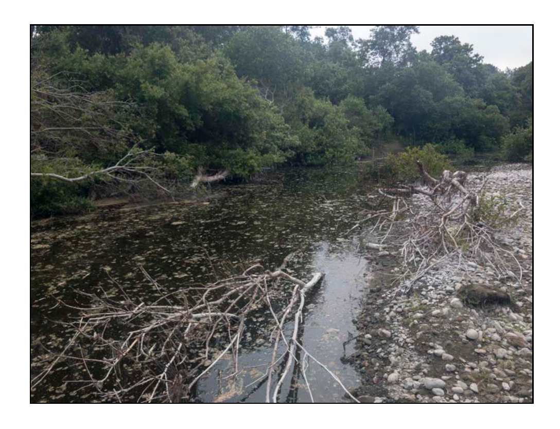
Red Legged Pool, Upstream