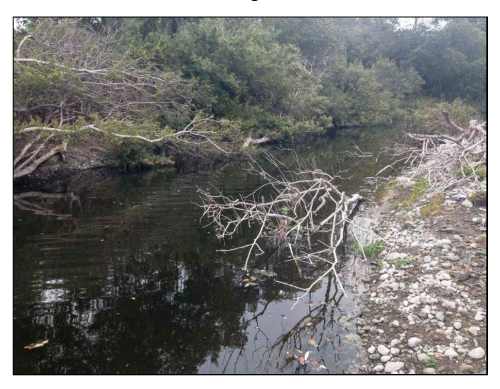
Red Legged Pool, Upstream