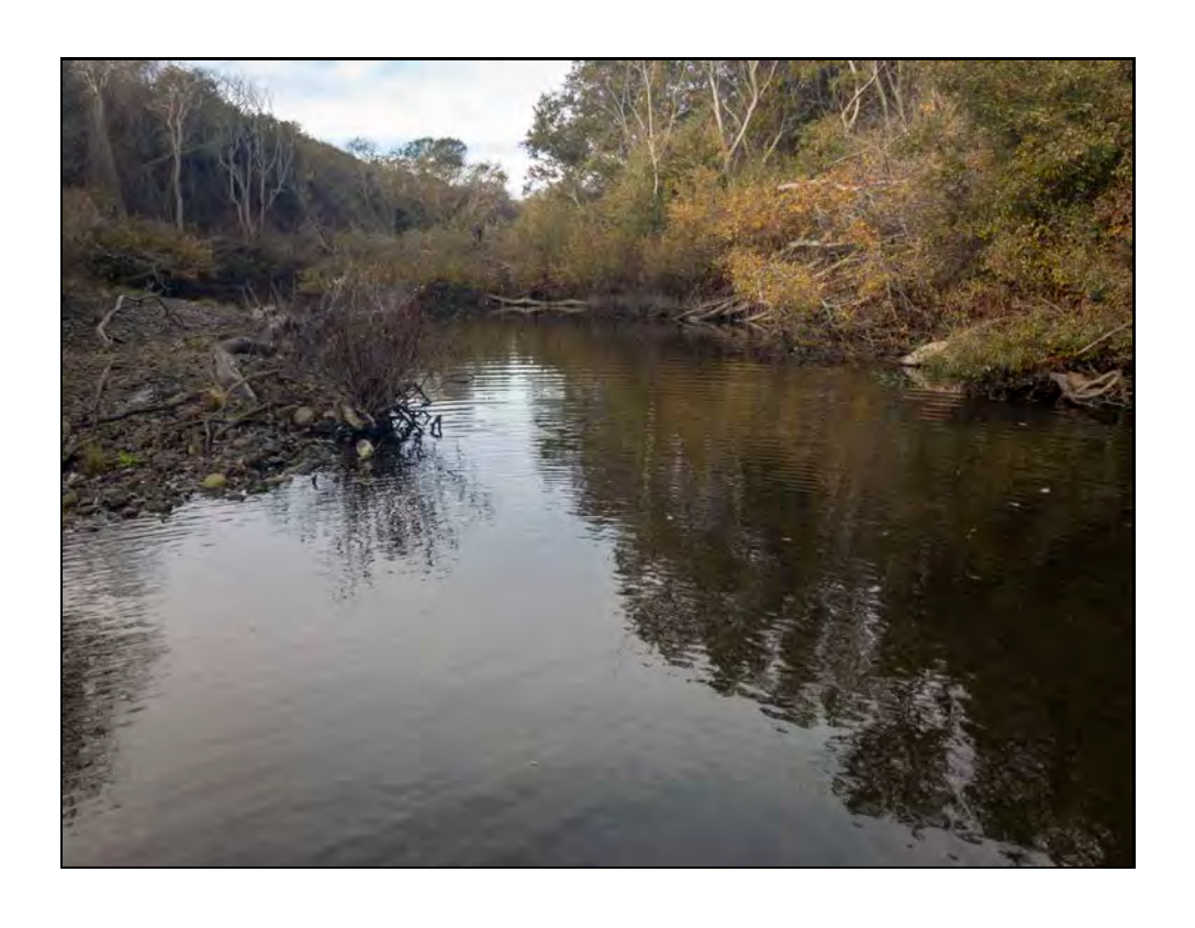
Downstream, Red Legged Pool