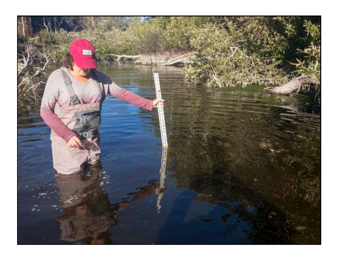
Red Legged Pool, Water Depth