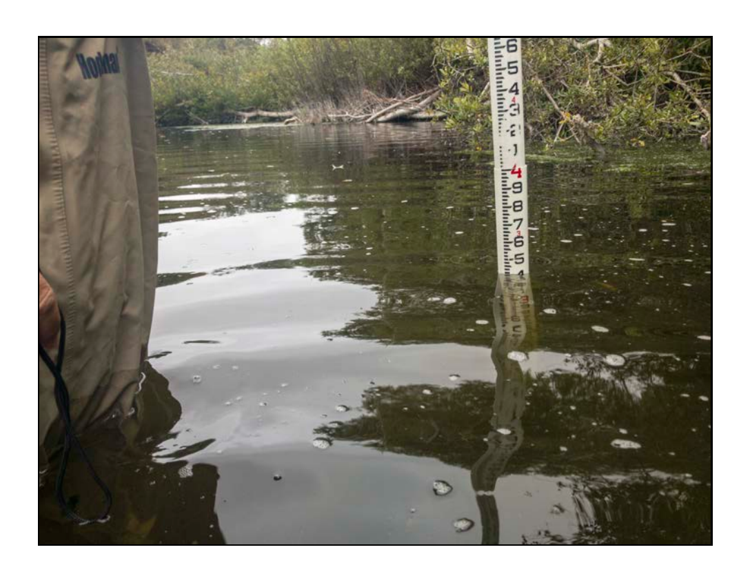
Red Legged Pool, Water Depth