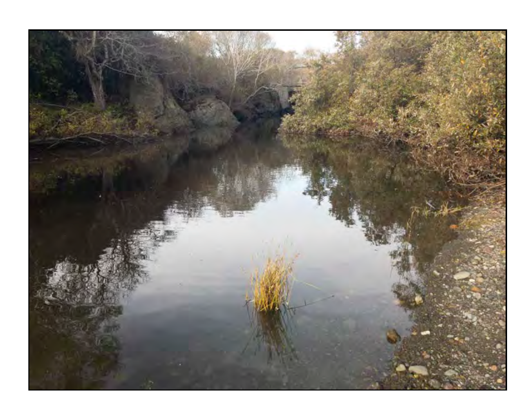
Downstream, Walking Bridge