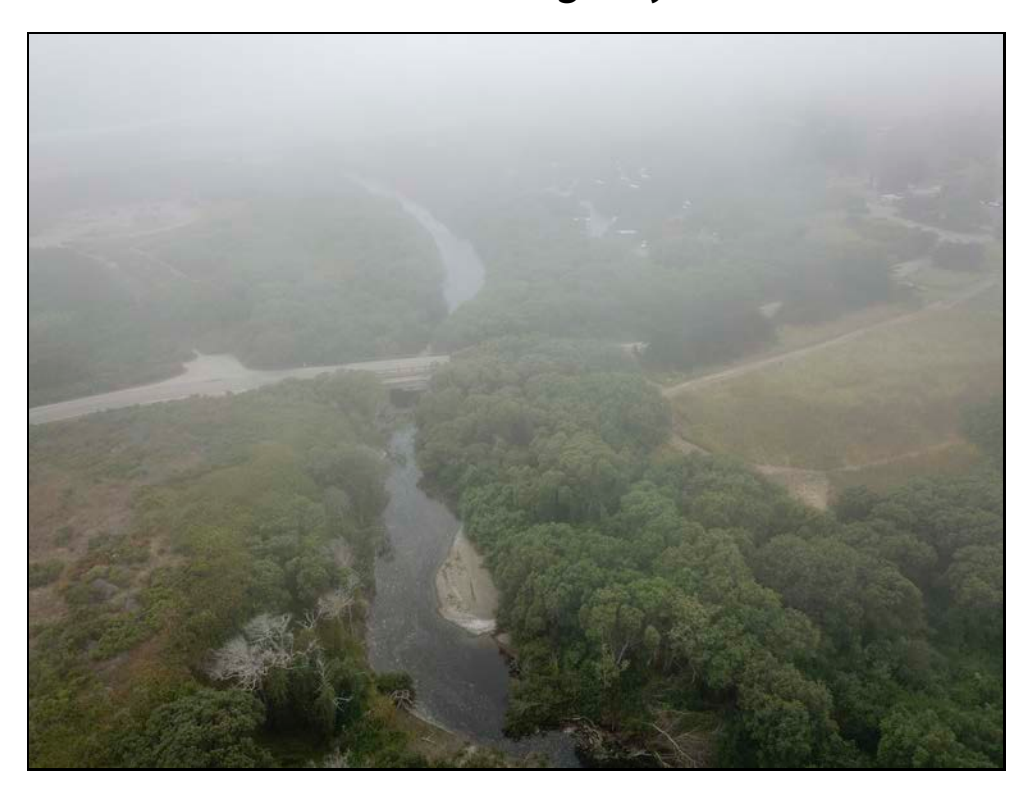
Aerial, Van Gordon Cr, Walking BridgeDCIM\100MEDIA\DJI_0137.JPG