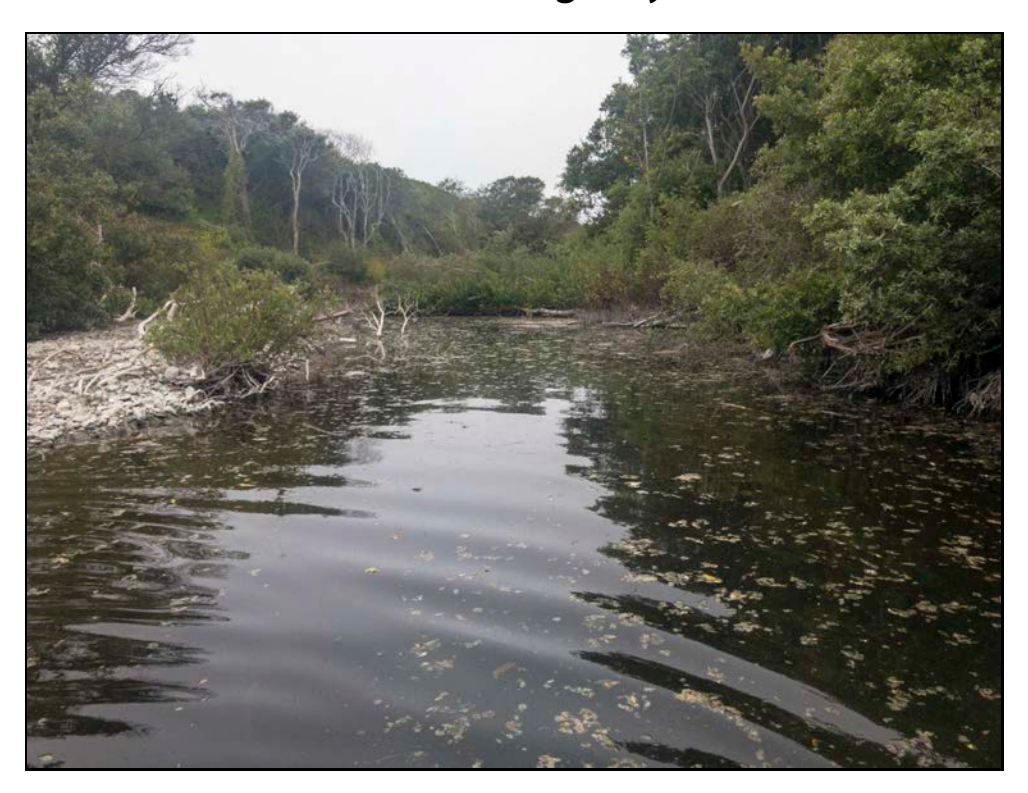
Downstream, Red Legged Pool