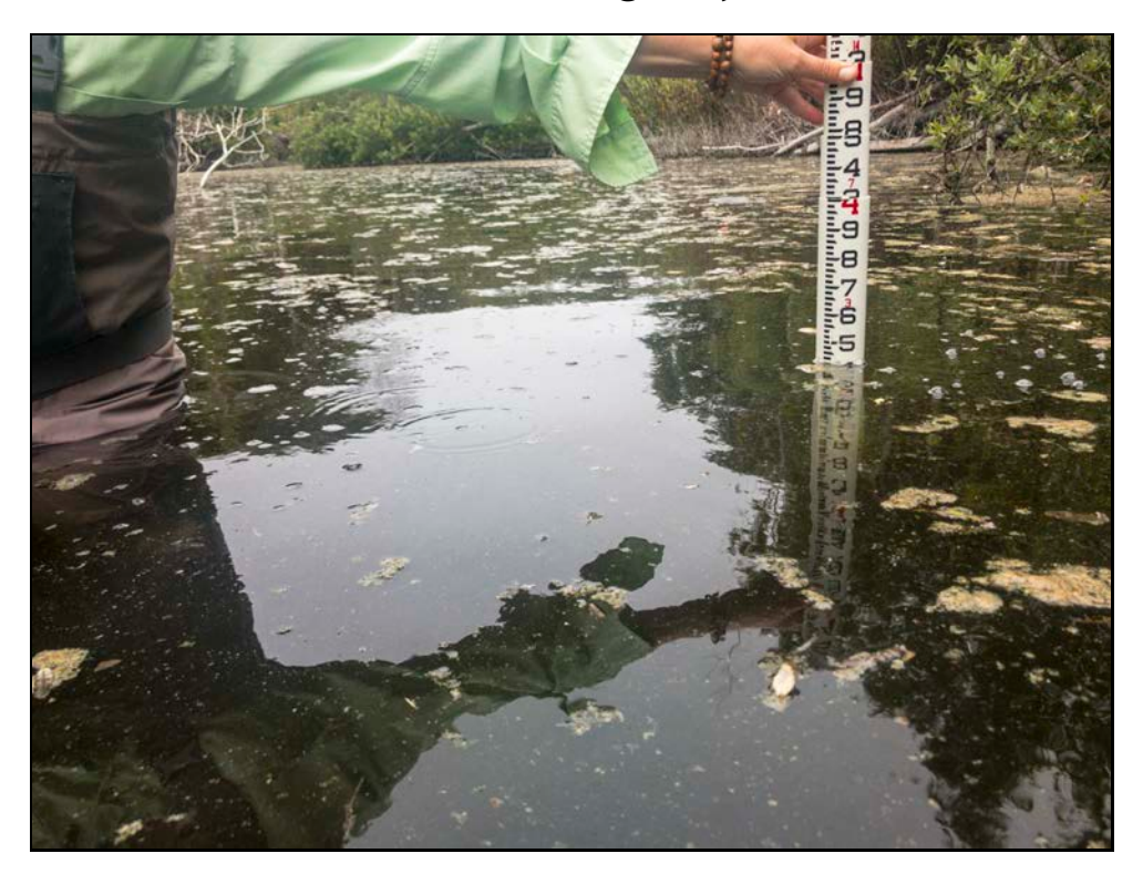
Red Legged Pool, Water Depth