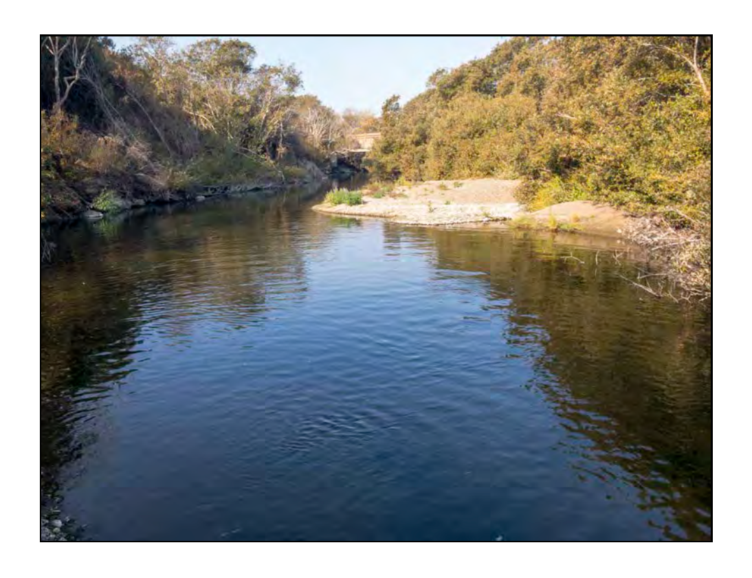
Downstream, Van Gordon Cr