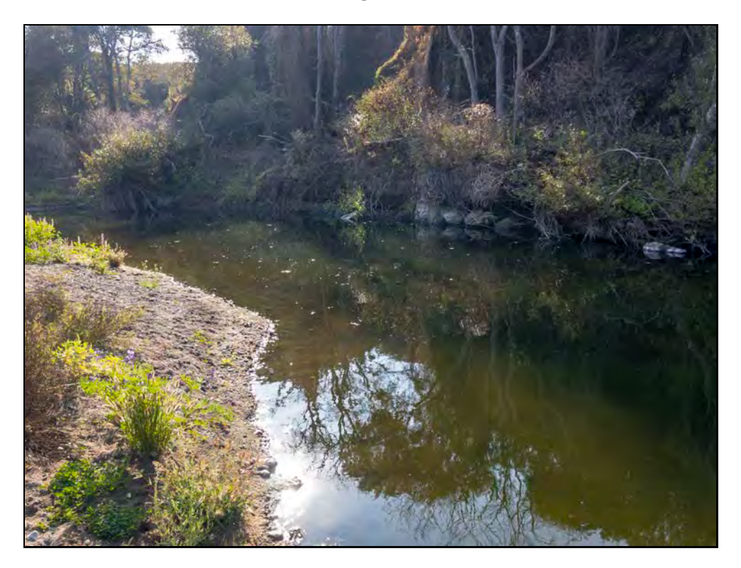
Upstream, Van Gordon Cr