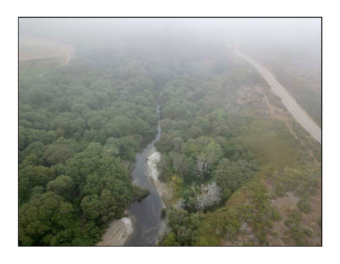
Aerial, Red Legged Pool, Van Gordon CrDCIM\100MEDIA\DJI_0135.JPG